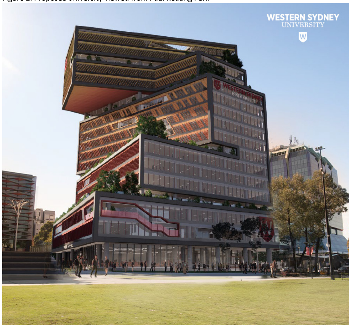
Figure 2: Proposed university viewed from Paul Keating Park