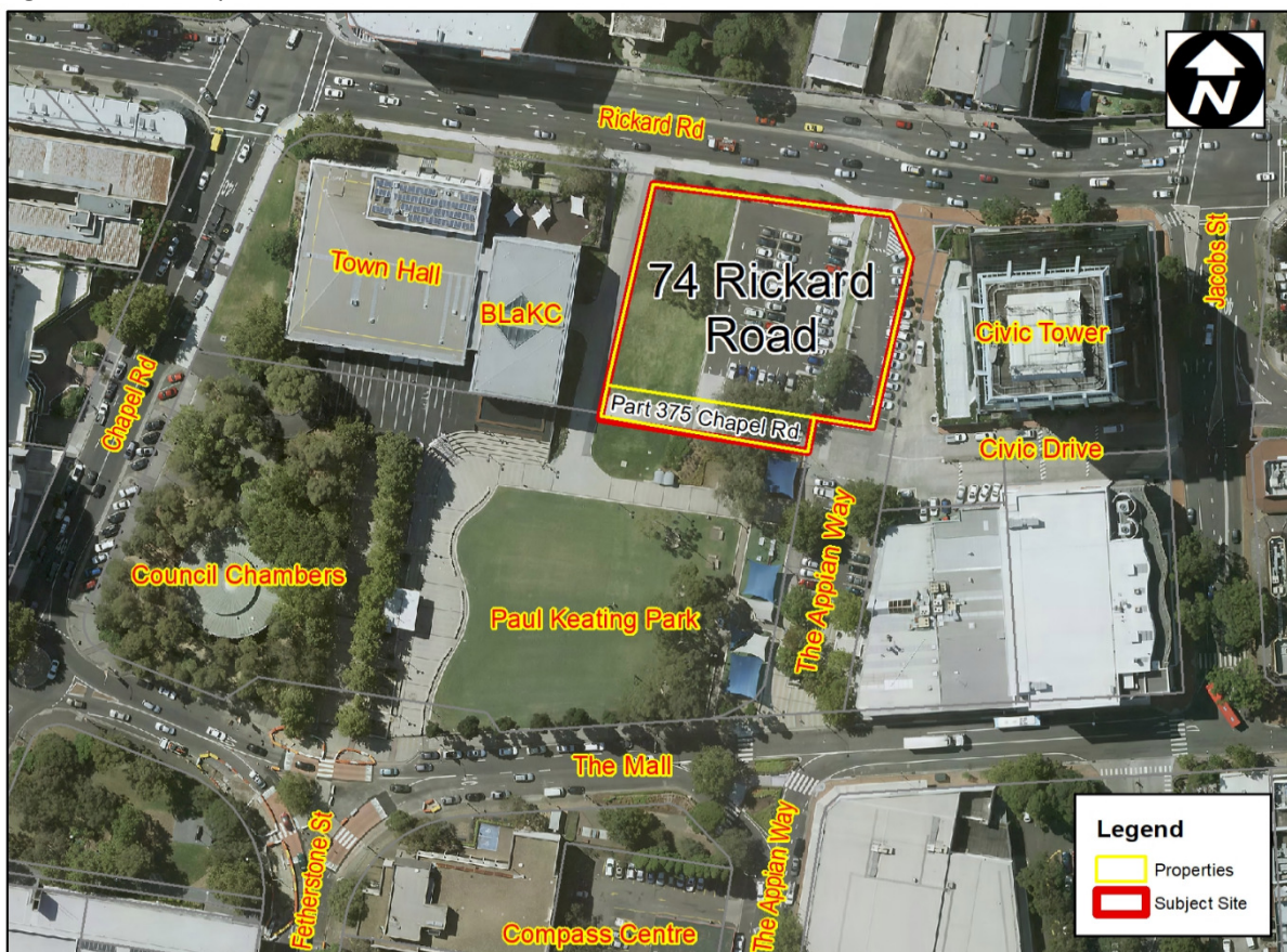
Figure 1: Site Map

The site is zoned B4 Mixed Use under Bankstown Local Environmental Plan 2015. Educational establishments (including universities) are permitted in this zone subject to consent. The maximum floor space ratio is 4.5:1 and the maximum building height is 53 metres. The existing Land Zoning, Floor Space Ratio and Building Height Maps are provided in Attachment A. The site is subject to an overland flow path and prescribed airspace restrictions. Vehicle access to the site is from Rickard Road.